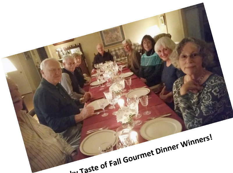
9 lucky Taste of Fall Gourmet Dinner Winners!